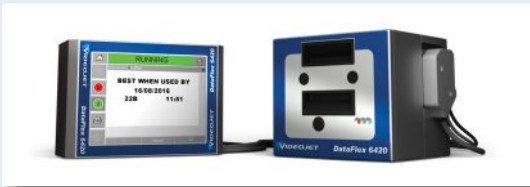
THERMAL TRANSFER PRINTER