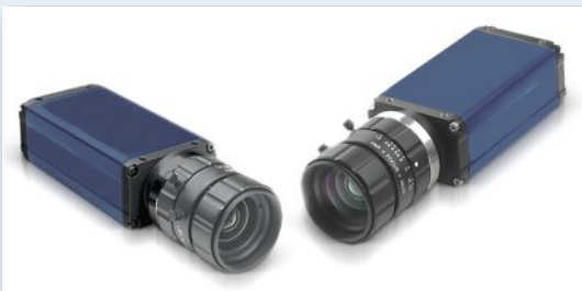
VISION INSPECTION SYSTEMS